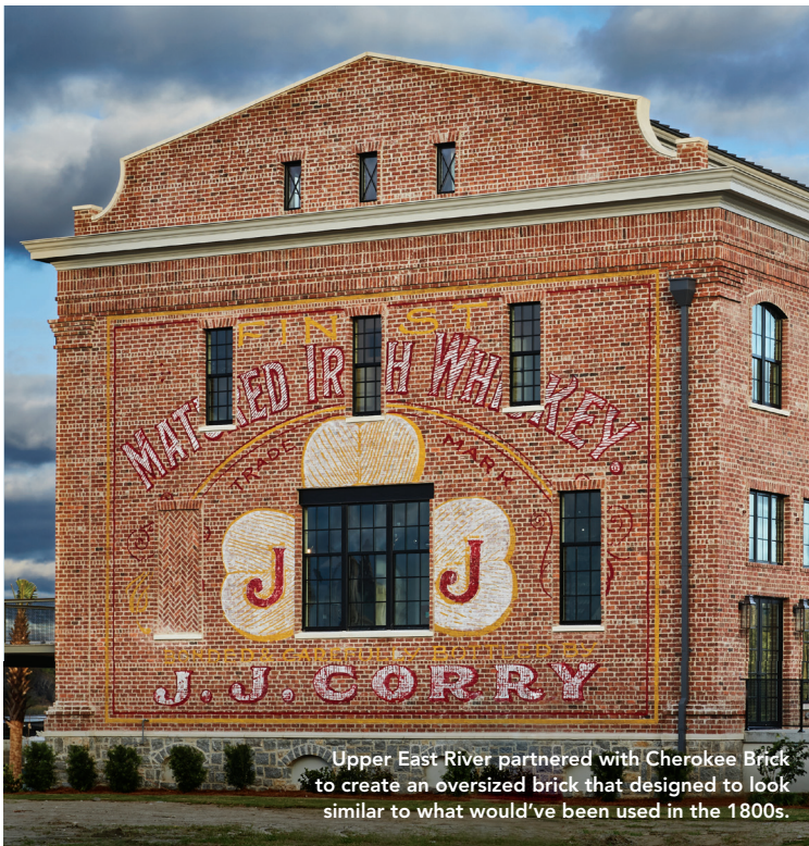
Upper East River partnered with Cherokee Brick to create an oversized brick that designed to look similar to what would've been used in the 1800s.