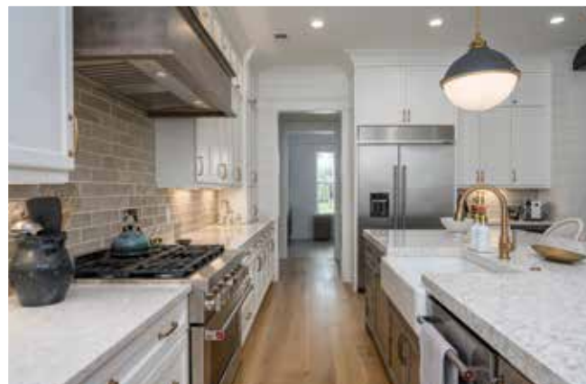
GOURMET HAVEN The kitchen combines sleek white cabinetry with a custom brushed metal range hood, offering a striking contrast of modern industrial design and classic sophistication.