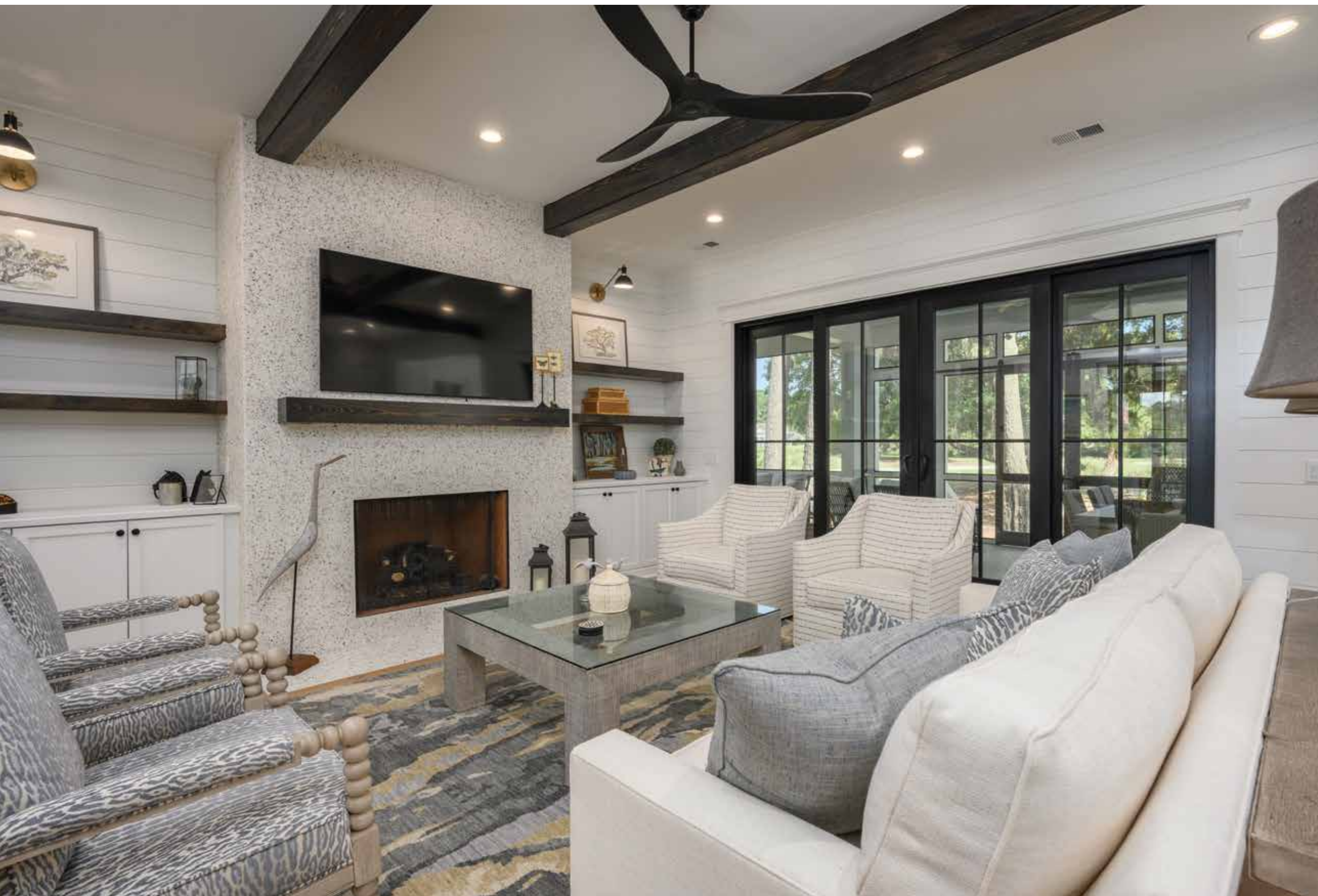
OLDFIELD CHARM, MODERN FLAIR This home in Oldfield by Pearce Scott Architects puts a modern twist on Lowcountry design with timeless architectural details and spacious interiors. Thoughtfully designed elements blend rustic charm with contemporary comfort, creating a home that is both stylish and welcoming.